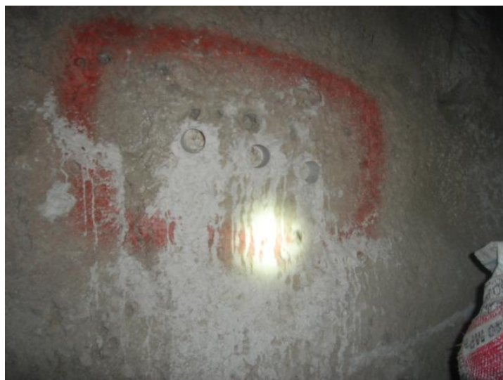
Figure 4 Photo showing the cores drilled out of the sidewall at grade elevation

The strength is monitored from cast cubes and cores drilled from the wetcrete walls and tested in the Rock Engineering Laboratory. Every ten linear metres, a block of 500 x 500 x 100 mm thick is sprayed on the sidewall at grade elevation as shown in Figure 4. Two cores samples are taken from these panels and tested to confirm the Uniaxial Compressive Strength of at least 30 MPa.