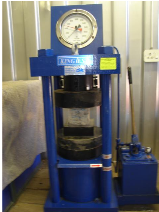
Figure 3 Cube tester