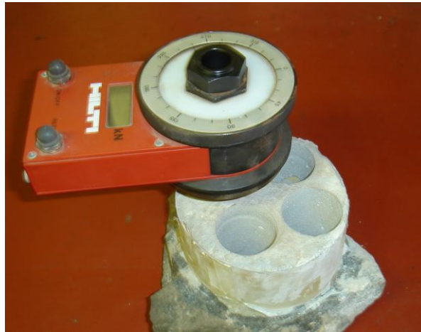
Figure 5 DPG100 tester from Hilti, testing the bond strength

Using a DPG100 tester from Hilti the tensile strength and bond strength to bare rock of the shotcrete is tested as shown in Figure 5.